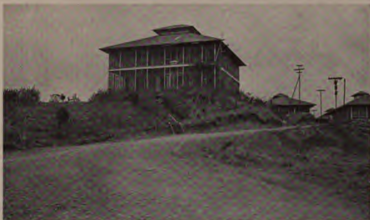
Gatun Police Station